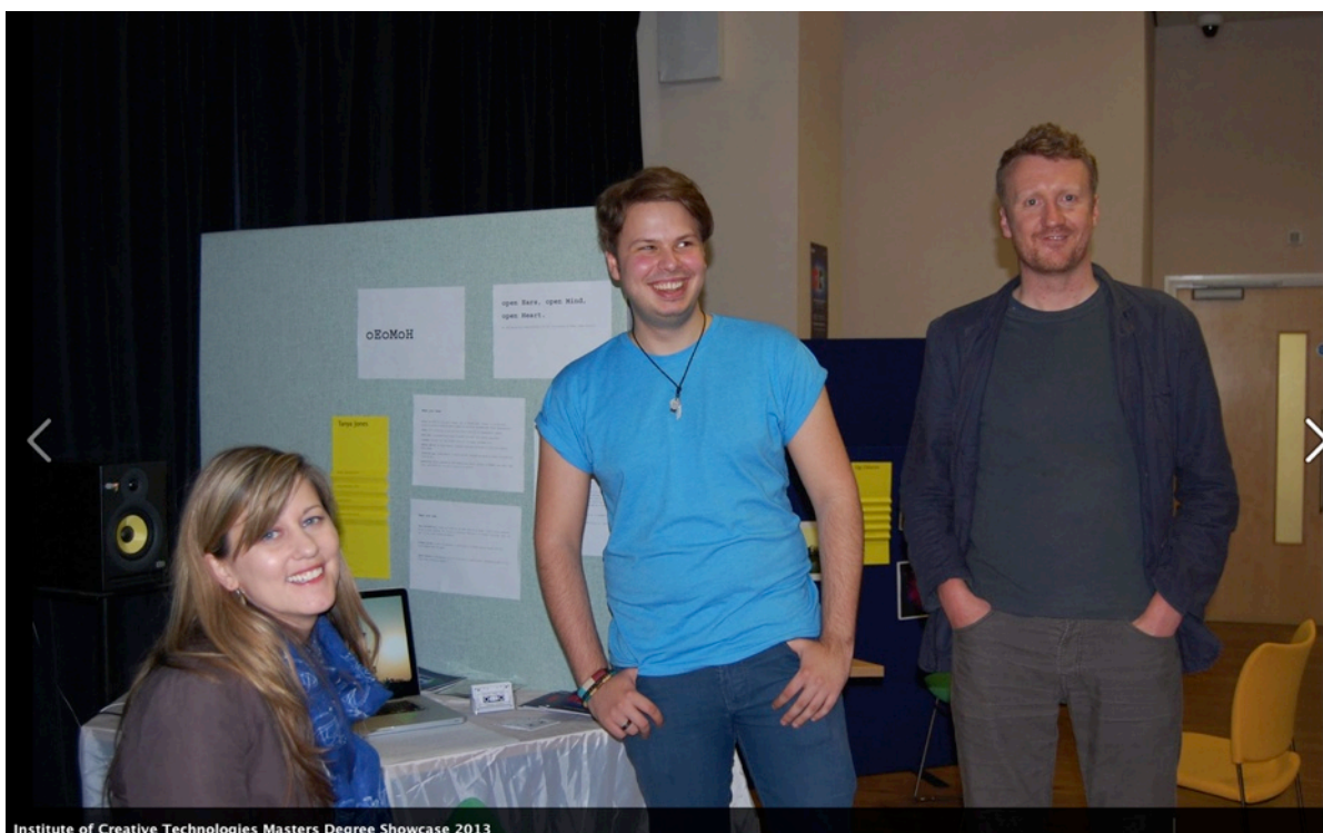
Institute of Creative Technologies Masters Degree Showcase 2013